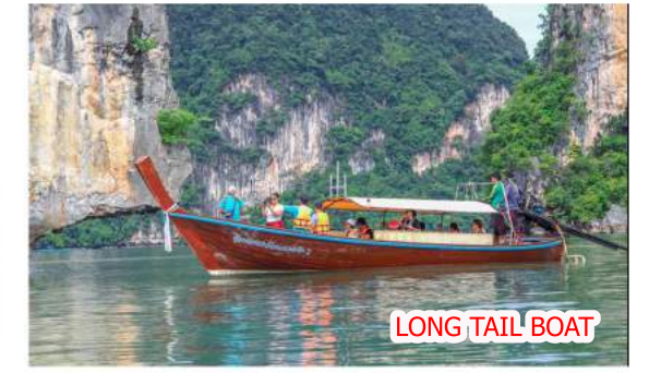
LONG TAIL BOAT