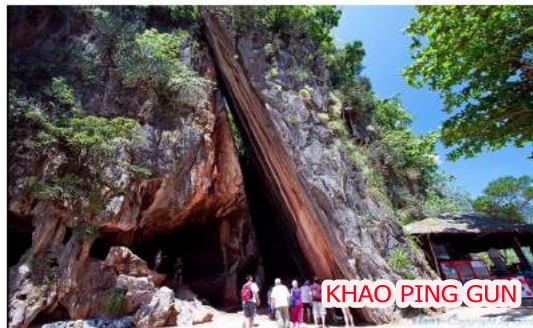
KHAO PING GUN