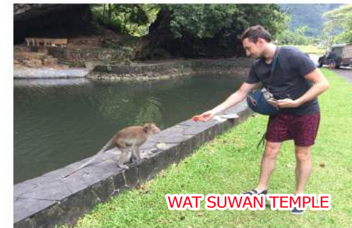
WAT SUWAN TEMPLE