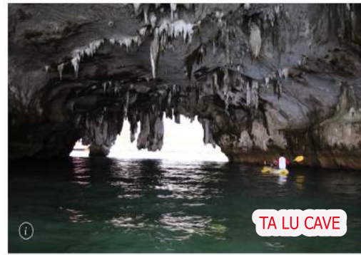
TA LU CAVE