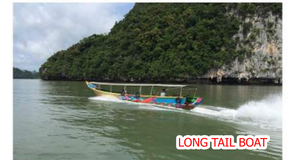
LONG TAIL BOAT