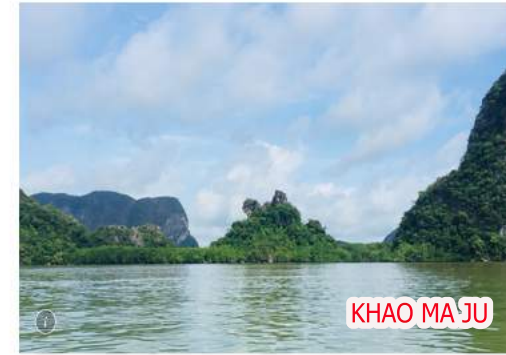
KHAO MA JU