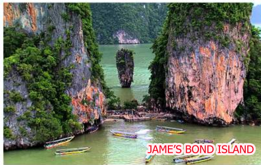
JAME'S BOND ISLAND