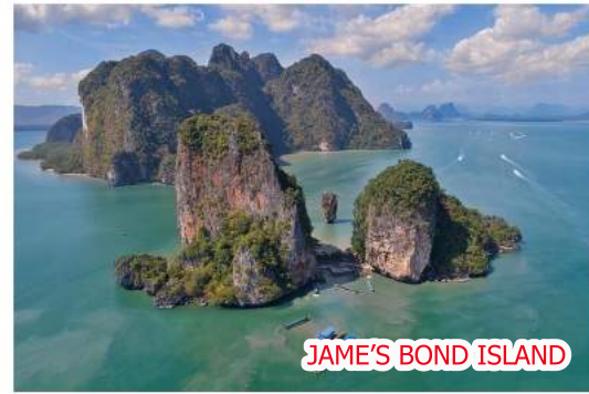
JAME'S BOND ISLAND