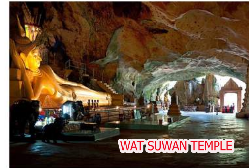
WAT SUWAN TEMPLE